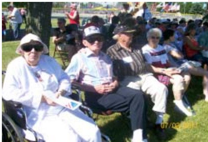
The crowd was much smaller than years gone by but veterans enjoyed the beautiful day and festivities.